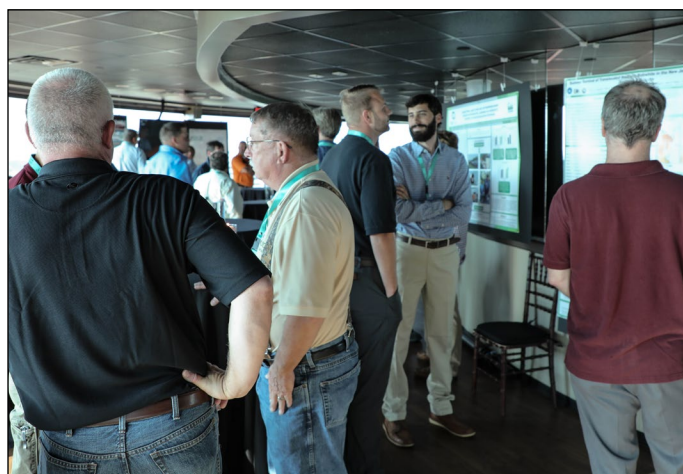
Attendees of the Joint Quail Conference enjoying four days of networking and 93 oral and poster presentations in what is arguably the largest collection in history of quail enthusiasts, biologists, and researchers.