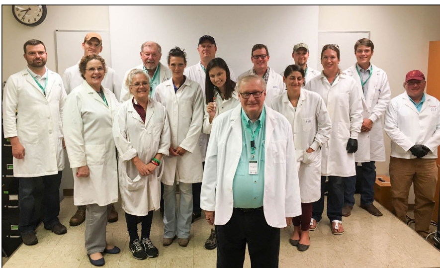
A group of Quail 8 attendees participate in a quail eyeworm removal workshop at UT College of Veterinary Medicine.